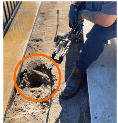
As technician injects Maverick Stabilization Grout into void behind seawall, signs of soil erosion were evident.

PROJECT Tampa Area Condominiums & Townhomes