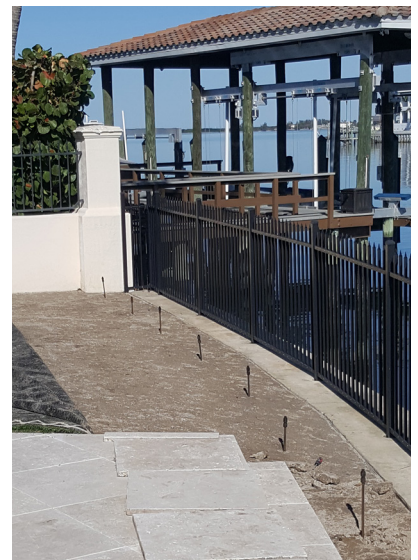
Pilot holes are drilled along top and sides of seawall, where Maverick Stabilization Grout will be applied. No digging or replacement of backfill of seawall was required.