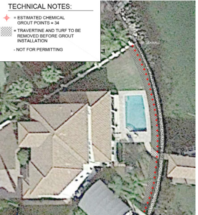
Injection port, to install Maverick Stabilization Grout, identified along condo property seawall, will fill voids caused by erosion and prevent seawall from collapse.

With the cost of constructing a new seawall averaging $45,000 per property, condo owners were seeking a more cost-effective and reliable alternative.