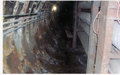
Condition of the tunnel and placement of the conduit prior to removal and rehabilitation.

Truly a collaborative effort, all parties worked together to achieve the desired results: A fully structural restoration, using a monolithic liner to eliminate all possibilities for future leaks and corrosion. Finally, it was completed by trenchless means, allowing the University to keep the Cathedral of Learning open throughout the entire process.