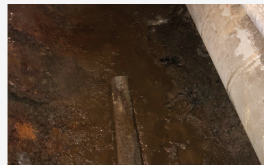
The original rounded floor of the steam tunnel was not only slippery, it was difficult for maintenance crews to gain purchase.