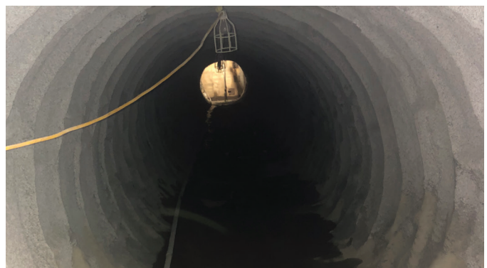
After the steam tunnel is lined with GeoKrete and floor leveled with Quad-Flow.