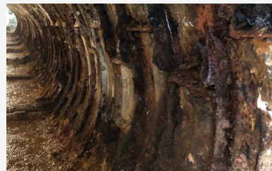
The old piping and conduit was removed prior to relining the tunnel with QLS/GeoKrete.