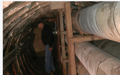
Severe corrosion threatened the structural integrity of the old steam pipe.