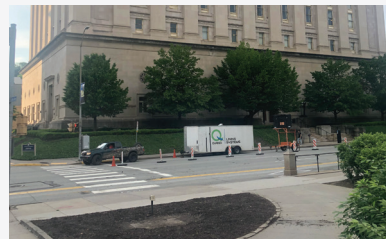
Note the small construction footprint of the QLS system.