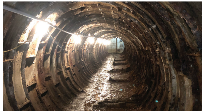
Condition of steam tunnel proper to QLS/GeoKrete® installation.

As opposed to direct burying steam, chilled water, electrical utilities, district energy systems across the country often create tunnel systems to carry these utilities through. This is done for ease of access and maintenance. Adding to the