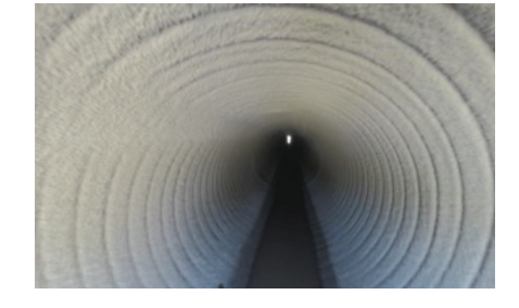
Pipe immediately after being lined with GeoKrete.