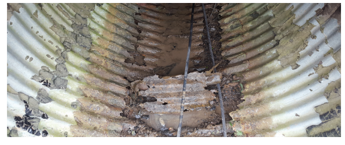
This old CMP culvert was completely corroded through in many areas.

When completely cured, the 54 year-old culvert is fully structural and ODOT can expect another 50 years of performance.