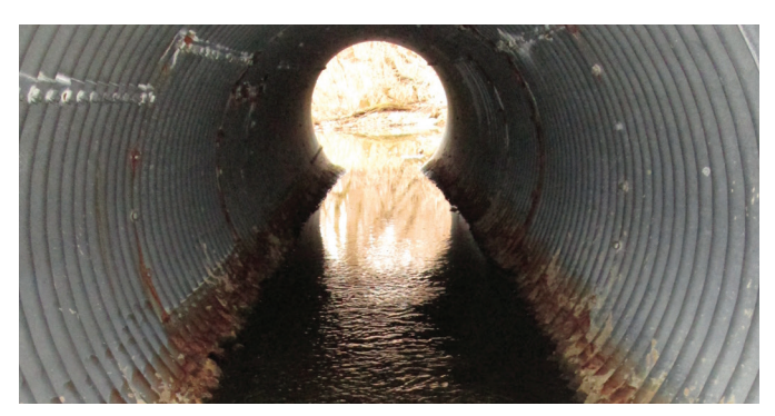
78" CMP was corroded and failing.

RB Jergens, the prime contractor, recommended the Quadex® Lining System as an alternative to replacement. The system features GeoKrete® Geopolymer and possesses both excellent corrosion resistance and structural properties. In this case, GeoKrete was spray-applied to achieve a thickness of 2" to protect and restore the culvert to its original integrity. The roadway above was never closed, however a temporary traffic signal (to control traffic flow) was installed in conjunction with the lining work to ensure proper safety for all crews involved.