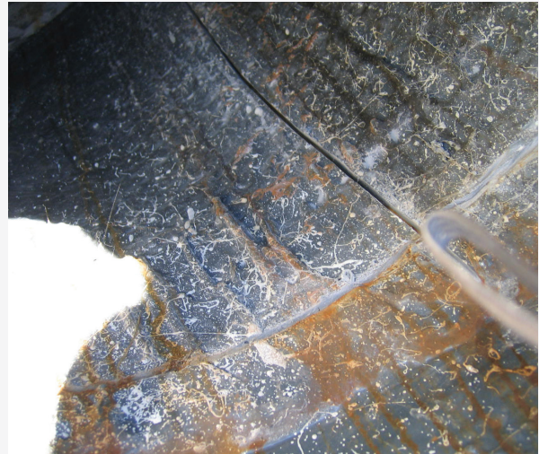
Polyurea coating peeled and flaked, exposing the concrete manholes to hydrogen sulfide gas and consequential corrosion.