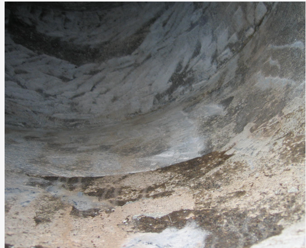
Failed Polyurea coating was removed before new GeoKrete coating was applied.