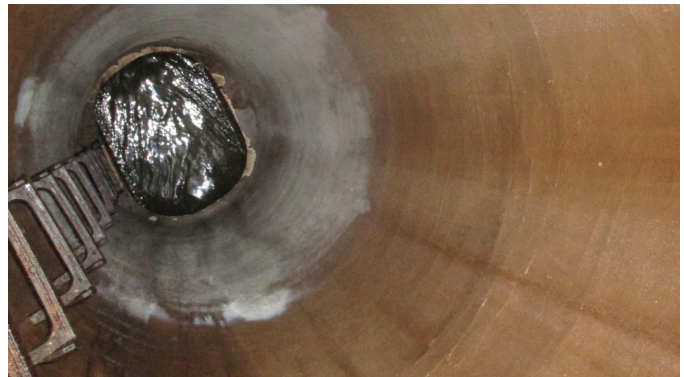
Same manholes 10 years after being relined with GeoKrete.