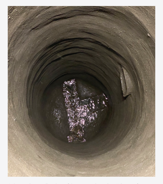
Prior to the application of Structure Guard, a 1" layer of AluminaLiner was applied for structure reinforcement.

GREENBOOK / CITY OF LOS ANGELES DEPARTMENT OF PUBLIC WORKS APPROVES STRUCTURE GUARD