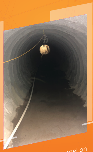
50 year-old steam tunnel on the University of Pittsburgh campus structurally rehabilitated with Geokretes geopolymer