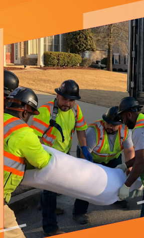
City of Philadelphia utilizes EnviroCure®-Felt CIPP liner