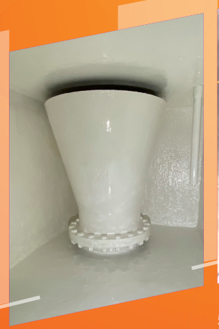
Denver-area water treatment facility applies Structure Guard® - Water to rehabilitate leaking and corroded flume and weir