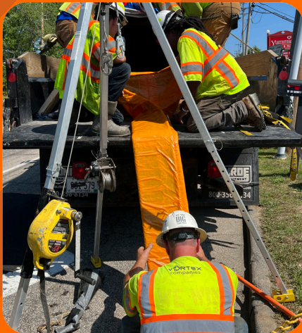
UV-Liner Pull Through