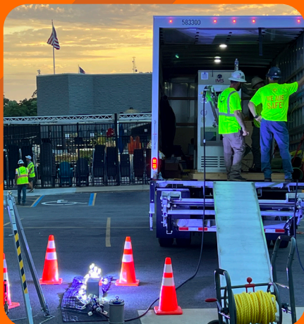
Custom Truck Builds