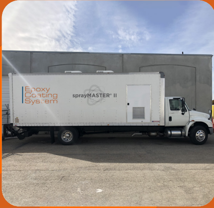
Standard Truck Build Out Configuration