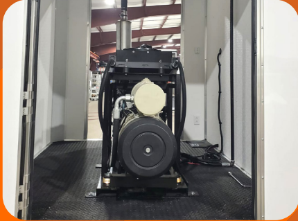
Separate Generator Room