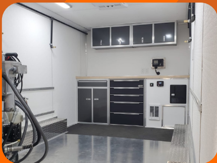
Industrial Strength Cabinets & Storage