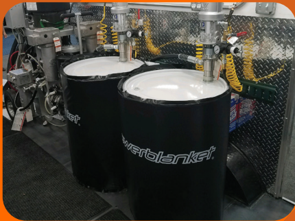
55 Gallon Drum Heaters