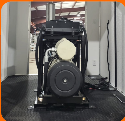
Spacious Design for Easy Access and Maintenance