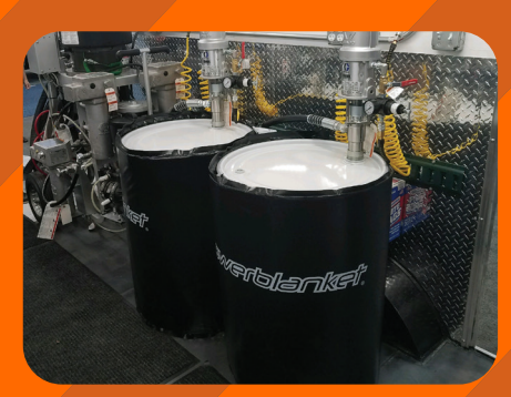
55 Gallon Drum Heaters