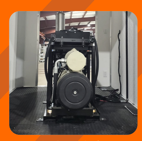
Spacious Design for Easy Access and Maintenance