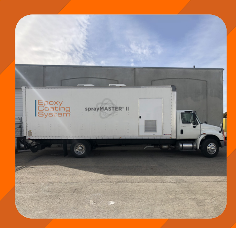
Standard Truck Build Out Configuration