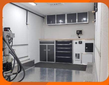
Industrial Strength Cabinets & Storage