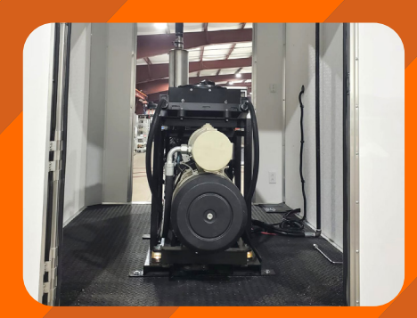
Separate Generator Room