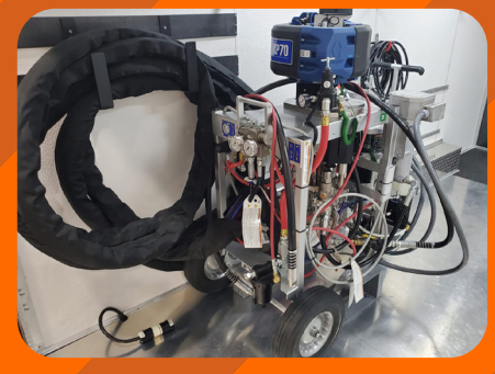
Plural Component Spray System