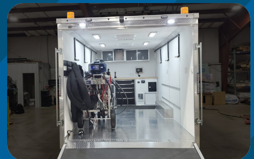
sprayMASTER® II Polymeric Trailer