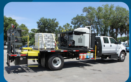
sprayMASTER® Non-CDL Truck

THIS YEAR'S DEDUCTION LIMIT IS $1,160,000!