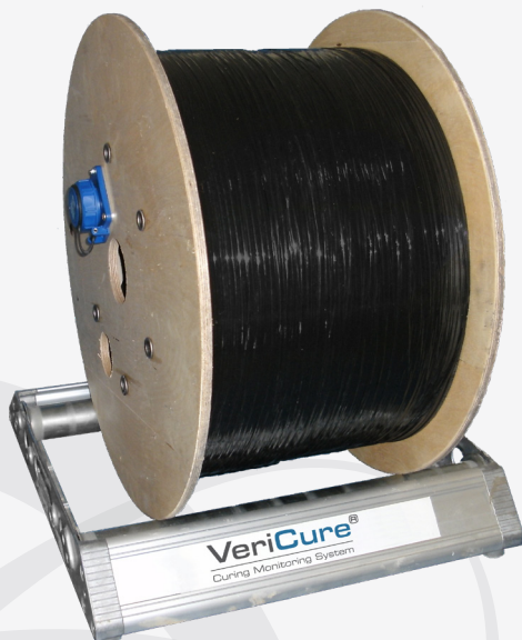
VeriCure CMS sensor cable with cable roller equipment as accessory.

US patents: US 8,162,535 B2 and US 13,403,393